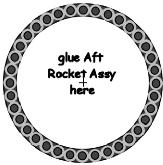
Used also as former for Rockets Ring